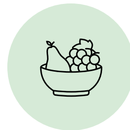
Diabetes HbA1c Poor Control