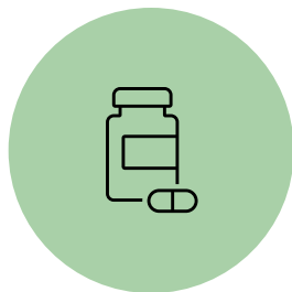
Initiation and Engagement in SUD Treatment